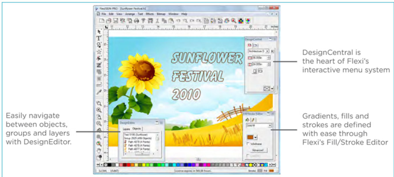
Flexi Cutting Software For Mac